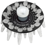
R-0.5/0.2M BS-010201-BK rotor

Rotor for 12 × 0.5 ml and 12 × 0.2 ml microtest tubes