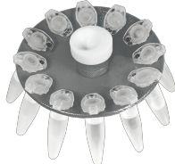
R-1.5M BS-010201-AK rotor

Rotor for 12 × 0.5 ml and 12 × 0.2 ml microtest tubes