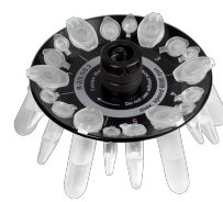
R-2/0.5/0.2 BS-010205-DK rotor

Rotor for 8 x 2/1.5 ml and 8 x 0.5 ml microtest tubes