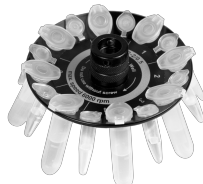
R-2/0.5 BS-010205-CK rotor

Rotor for 8 x 2/1.5 ml and 8 x 0.5 ml microtest tubes