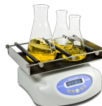
PSU-10i Without platform Orbital Shaker

Shaker PSU-10i provides regulated orbital motion of the platform and is designed for use both in small specialized biotechnological laboratories and in large multidisciplinary laboratories: a choice of five (5)